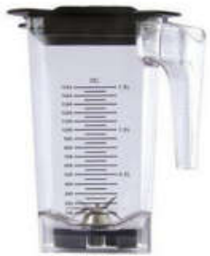
1.5 Ltr Jug

1.5 Litre Eastman Tritan BPA-Free Jug, Stainless Steel Blades (6 blades in a 2-blade system), Lid and Tamper Set. This jug will fit the OmniBlend I and the OmniBlend V blenders. This 1.5 Ltr jug is better at blending liquids.