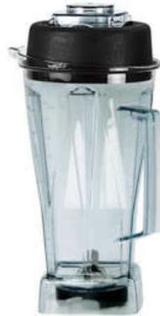
2 Ltr Jug

1.5 Litre Eastman Tritan BPA-Free Jug, Stainless Steel Blades (6 blades in a 2-blade system), Lid and Tamper Set. This jug will fit the OmniBlend I and the OmniBlend V blenders. This 1.5 Ltr jug is better at blending liquids.